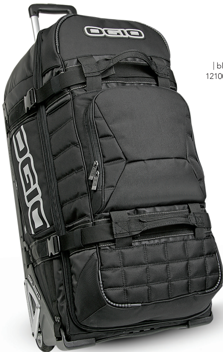
| black 121001_03

RIG T-3 | RIG 9800 PRO | RIG 9800 | DOZER | TRUCKER |