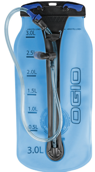
| 3.0 L