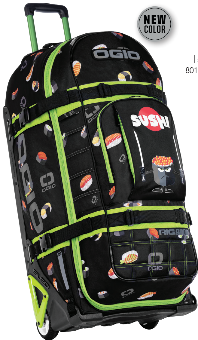
| sushi 801003.23

RIG T-3 | RIG 9800 PRO | RIG 9800 | DOZER | TRUCKER |