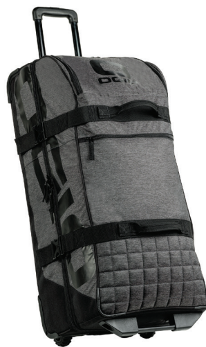
| dark static 801001.02