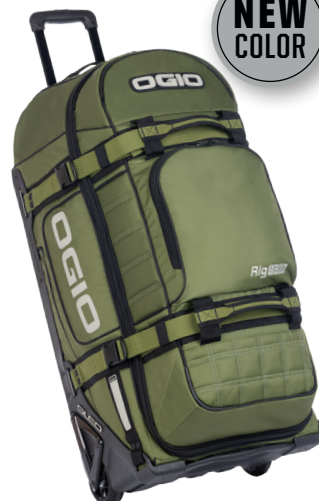
| green 801000.04