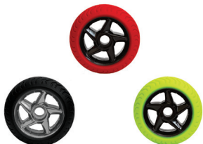
| silver/black 801003.999