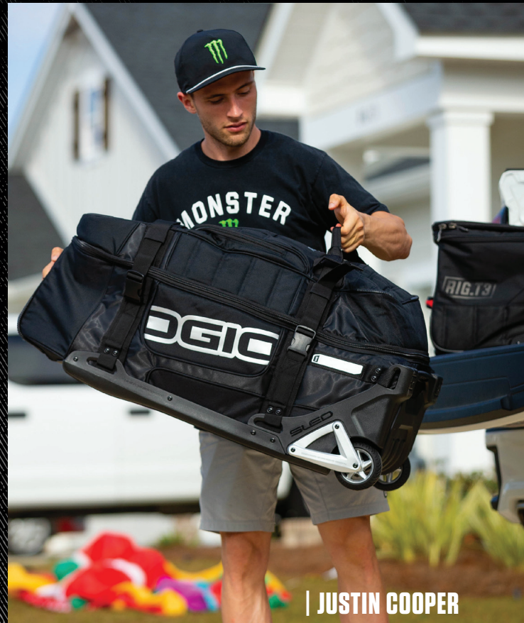
| JUSTIN COOPER

34"H x 16.5"W x 15.25"D / CM 86 H x 42 W x 39 D 14.2 Lbs/6.4 Kg + 7500 Cu.In/123 L 420D dobby poly, 420D diamond rip stop, 600D poly