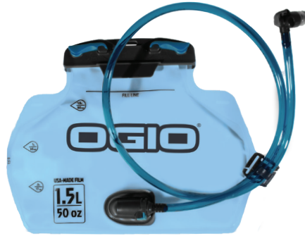
| 1.5 L