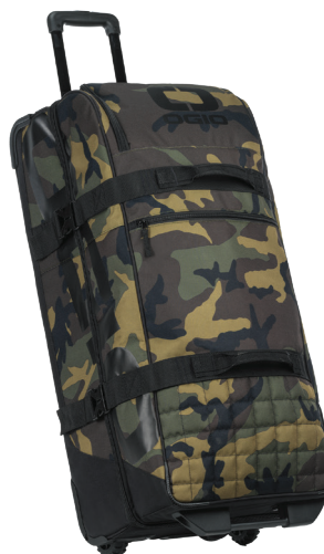
| woody 801001.07