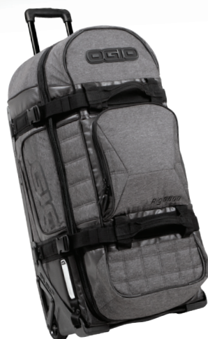
| dark-static 5919316OG