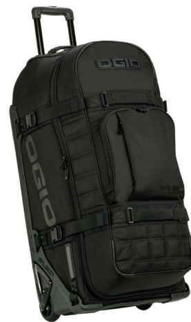
| blackout 801003.01