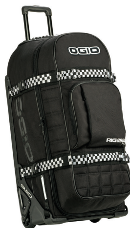
| fast times 801003.04