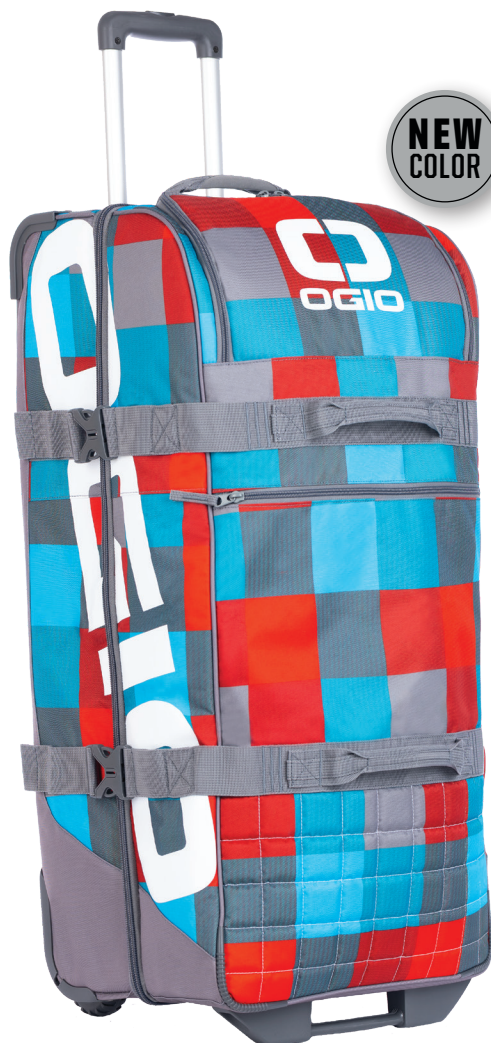
| blockade 801001.12