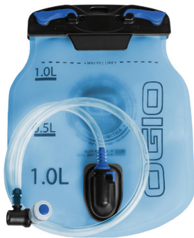
| 1.0 L