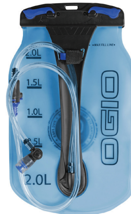
| 2.0 L