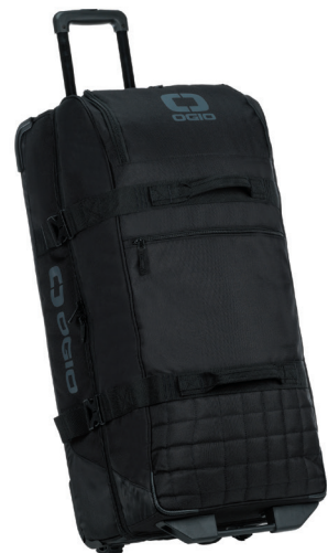
| black 801001.01