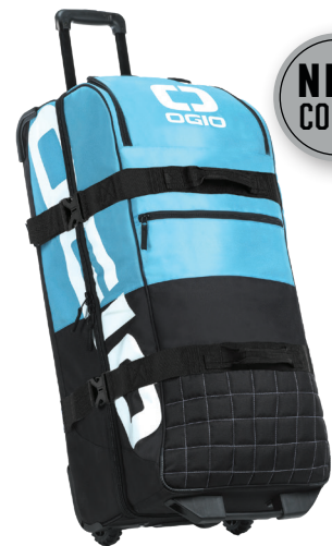
| maui 801001.11