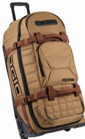
| coyote 801000.02