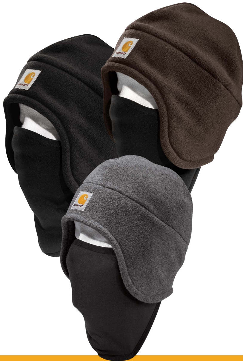
Fleece Hat CTA207