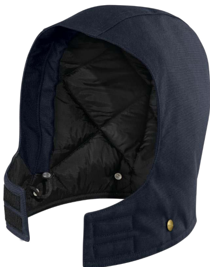
Firm Duck Hood CT102368