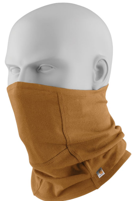
Cotton Blend Filter Pocket Gaiter CT105086