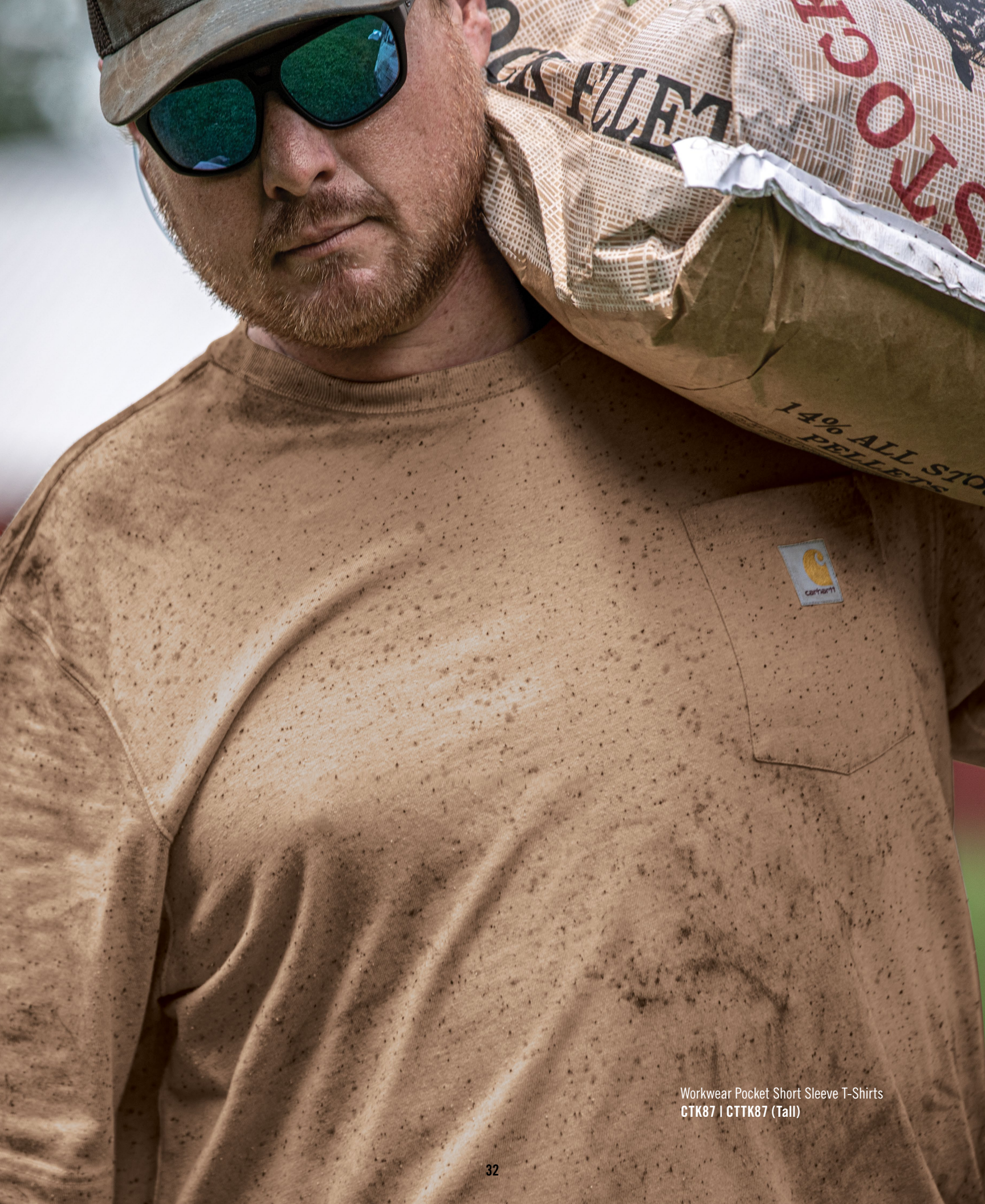
Workwear Pocket Short Sleeve T-Shirts CTK87 | CTTK87 (Tall)