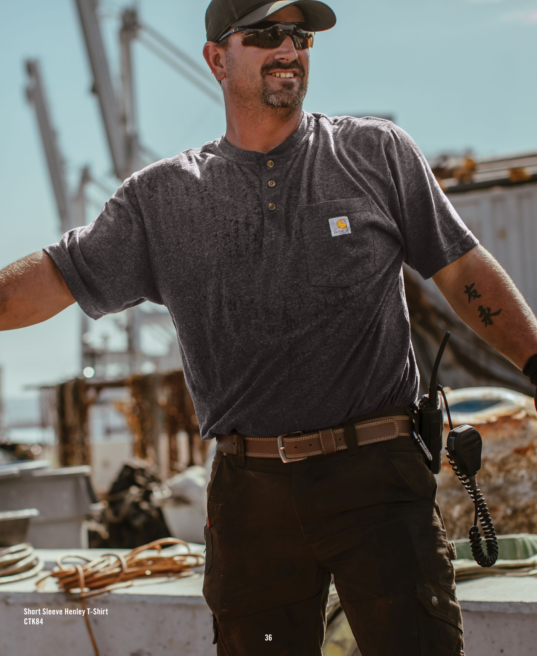
Short Sleeve Henley T-Shirt CTK84