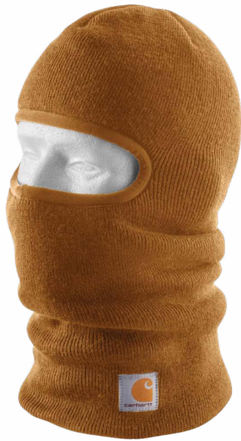
Knit Insulated Face Mask CT104485