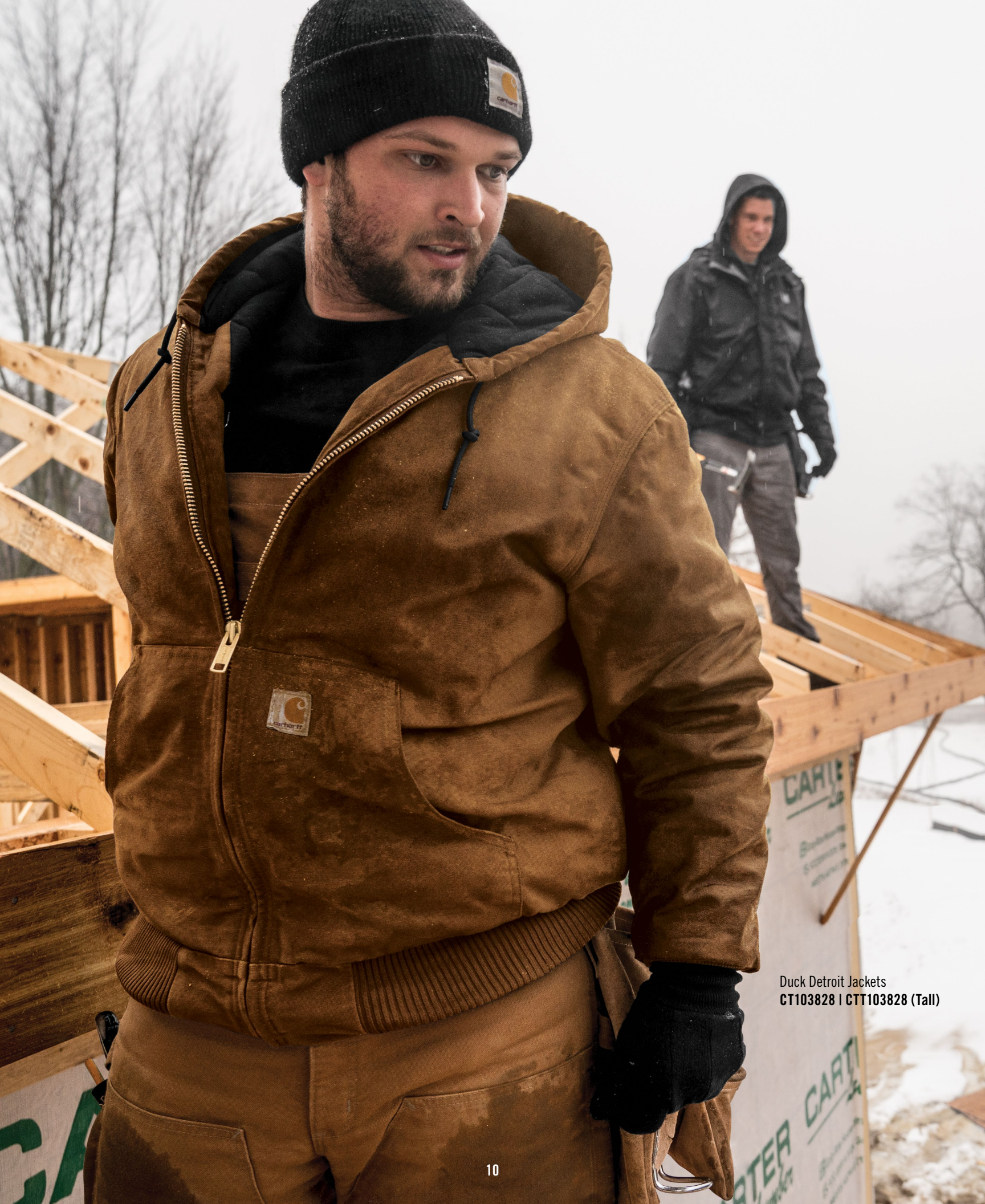
Duck Detroit Jackets CT103828 | CTT103828 (Tall)